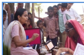
Door to Door Eye Check up