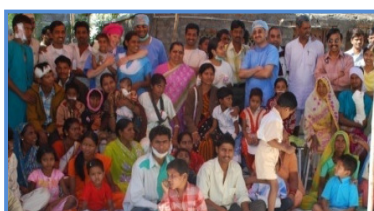
Happy Patients after Plastic Surgery