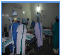
Fully Equipped OT