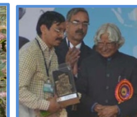
Felicitation by Hon. Abdul Kalam.