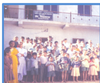
School Children Check up