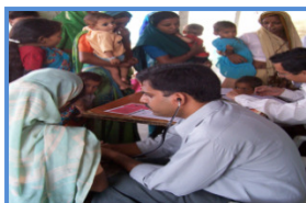
Pediatric Check up