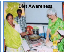
HBCC -VHW at Work