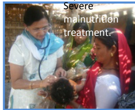
Critical Patient- Management